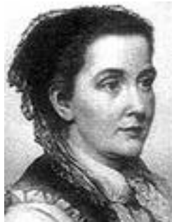
Julia Ward Howe

“Our sons shall not be taken from us to unlearn all that we have taught them of charity, mercy and patience,” Julia Ward Howe, 1870. Mother's Day was first organized 138 years ago by abolitionist, suffragette and poet Julia Ward Howe. In 1870 she organized a Mother's Day for Peace to promote peace and speak out against war. On May 11, 2008, we at FUS will honor the work of mothers and all others who teach patience, charity and mercy. There will be poetry, songs and words of inspiration from our members.